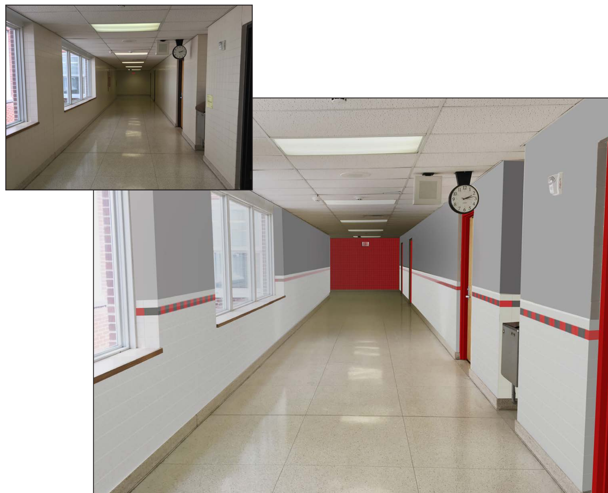
Corridor Finish Improvements