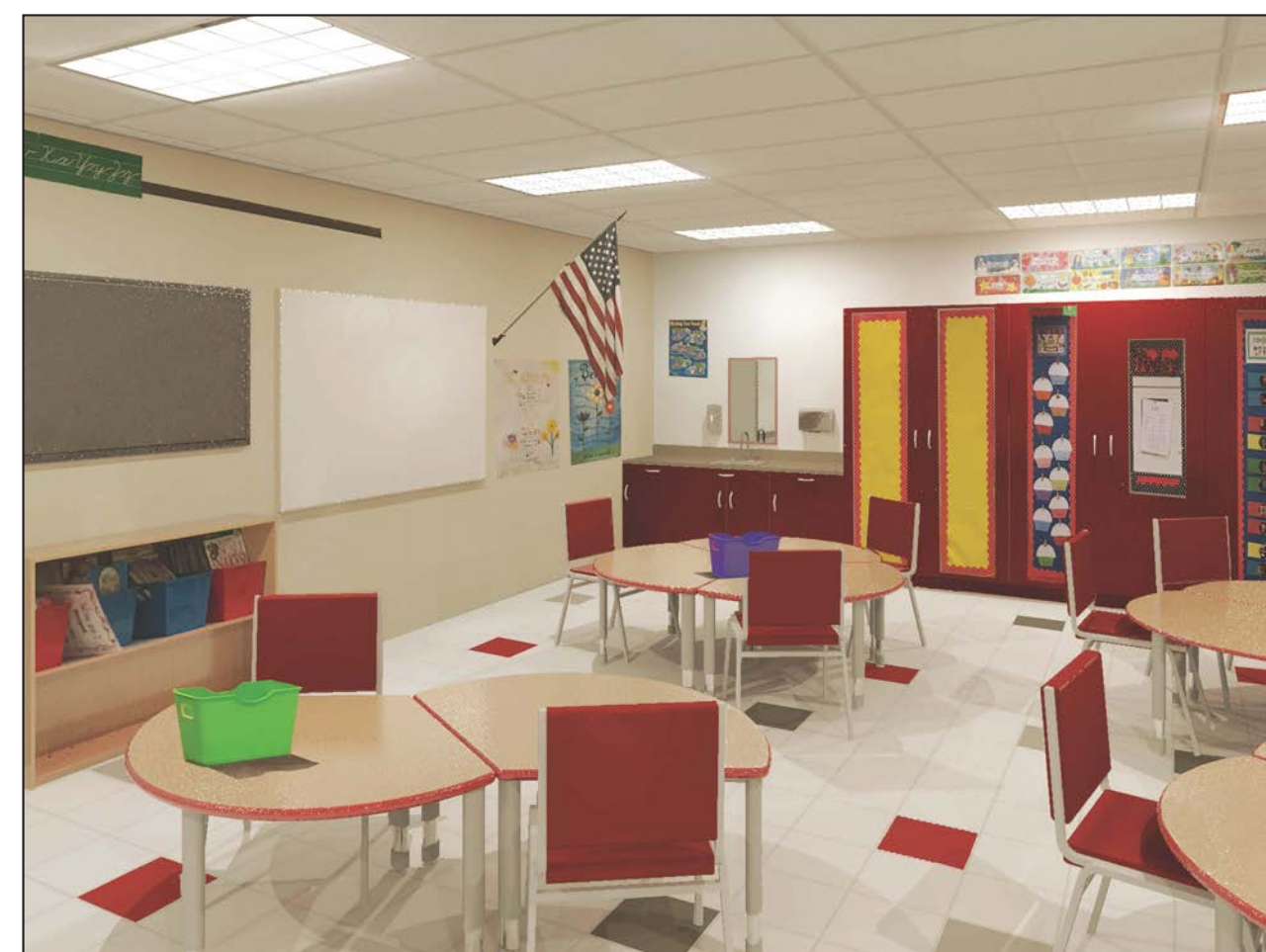
Elementary Classroom Refurbishment