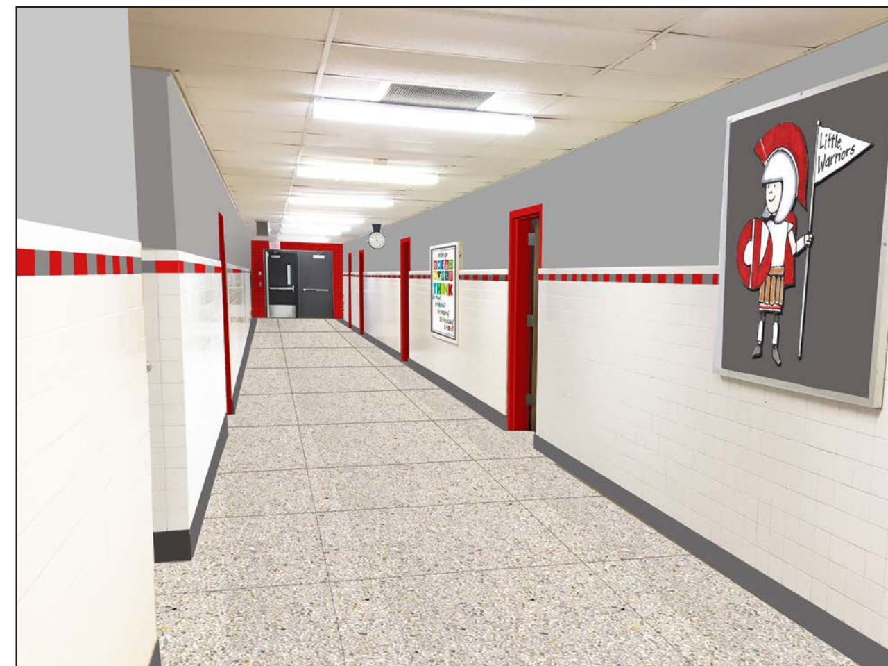
Elementary Corridor Finish Improvements