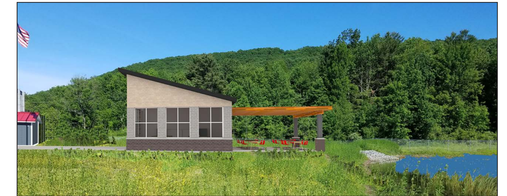
Sustainable Greenhouse & Classroom