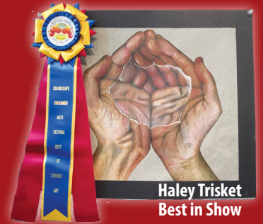
Haley Trisket Best in Show