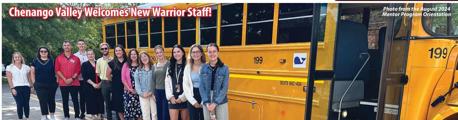
Photo from the August 2024 Mentor Program Orientation

The following Warrior staff members are either new to the district or have moved into new roles for the 2024-2025 school year: