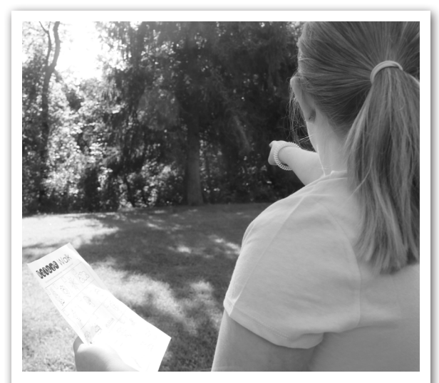
CV Elementary Summer STEAM : Students reinforced and practiced academic skills through hands-on, project-based learning. This year's theme was "Our Backyard."

Chenango Valley was proud to provide Chenango Valley students the opportunity to participate in a variety of programs this summer. In addition, CV students were able to participate in programs through Broome-Tioga BOCES. These programs work to inspire, engage, and empower students to achieve their full potential year-round. See more information and photos at: <u>www.cvcsd.stier.org</u>