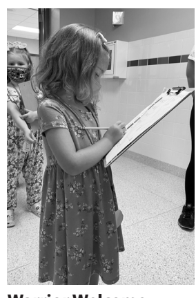
Warrior Welcome: Kindergarten students were introduced to Port Dickinson Elementary with fun-filled activities such as riding the bus and eating school meals!