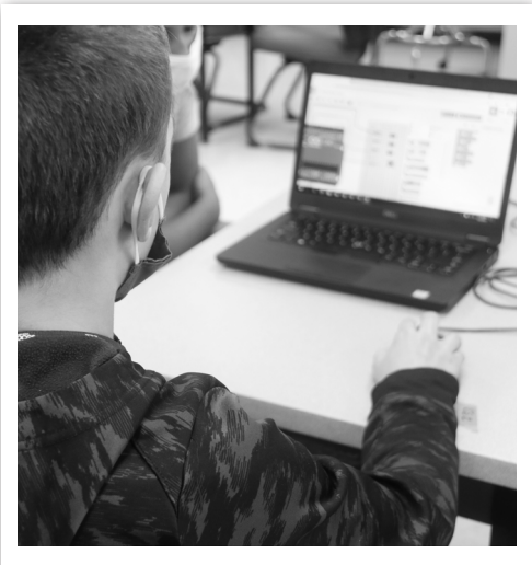
BOCES STEAM : During this two-week, hands-on program, students engaged in STEAM project-based learning through the design cycle. Students also explored and developed projects with real-world applications.