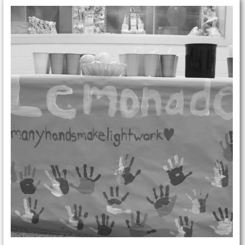
Warrior FUNdamentals : This new summer program offered an opportunity for restorative learning through fun, project-based education and skill reinforcement. Pictured above is a lemonade stand hosted by students, incorporating math and other learning opportunities.