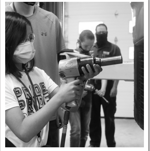
BOCES Career Exploration Program: This career and technical education (CTE) program introduced students entering sixth grade to multiple career pathways and the foundational skills necessary to succeed in today's job market through direct teacher instruction and project-based learning.