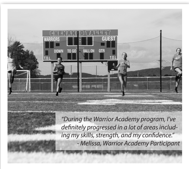
Warrior Academy : Chenango Valley students entering grades 6-12 enjoyed participating in this CV Athletics strength and conditioning program!