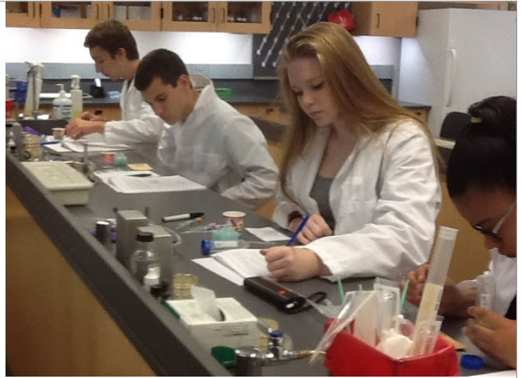
Above, students conduct experiments during the summer STEAM program, held in conjunction with SUNY-Broome.

Over the summer, students from Chenango Valley participated in two different STEAM (Science-Technology-Engineering-Art-Math) programs, one in partnership with SUNY-Broome, and one with BOCES.