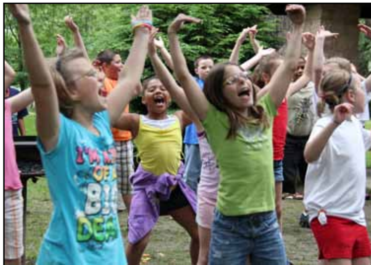
Pictured: Students dance to the Village People's YMCA at the annual picnic.