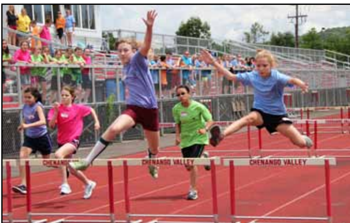
Pictured: Sixth grade students compete in the 50-meter hurdle event at annual Field Day competition.

A day full of friendly competition and building camaraderie with classmates was a great way to end the school year.